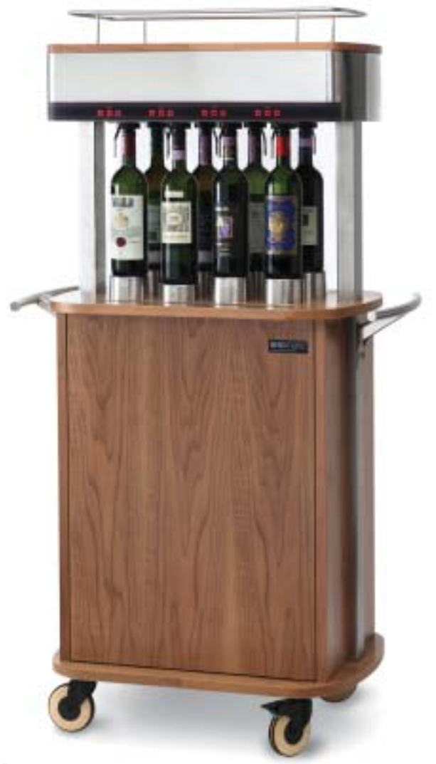
Our enomove models are available in a wide range of stainless steel, timber and coloured finishes to suit any decor or branding.